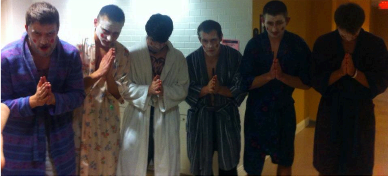
(Pictured above: Six of our seven Freshmen participating in Kappa Karaoke)